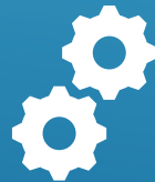
BUSINESS PROCESS DESIGN