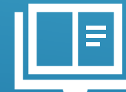
TRAINING & ROLL-OUT