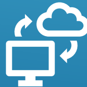
PRODUCT SELECTION TRANSITION TO CLOUD & INTEGRATION